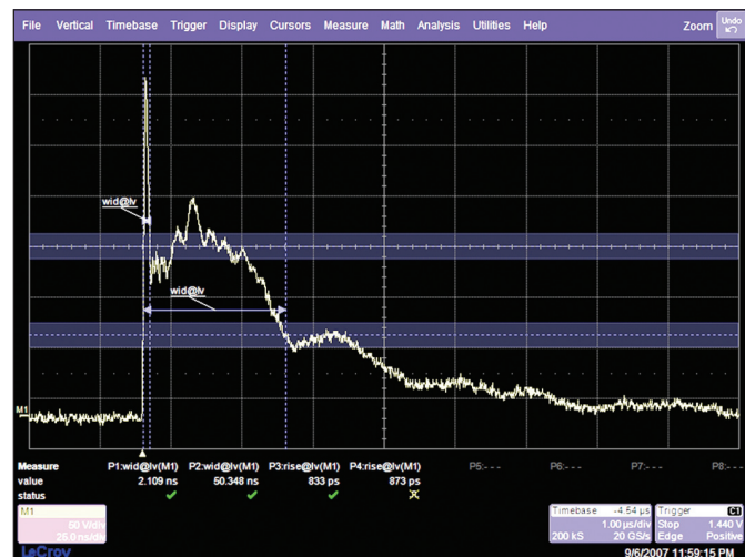
Figure 2. Comparison of standard vs. EMC thresholds for pulse measurement parameters. Use of standard pulse thresholds produced more than 2000% error on this electrostatic discharge pulse.

measurement filtering capability, available on modern scopes, allows for pulse-like perturbations on the falling edge of a pulse to be ignored and excluded from the measurement results.